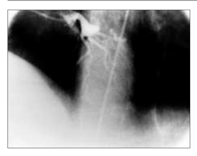
Figure 1. Left anterior oblique view (with cranial angulation) of an aneurysm involving the main stem of the left coronary artery.